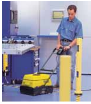
Compact The BR 400 takes automatic scrubbing technology into confined areas where bigger units can't go.