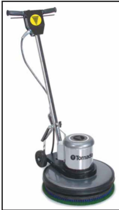
M SERIES 17" & 20" MODEL NO: 97590 17" 97595 20"