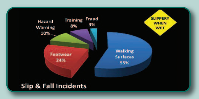
Reduce Slip & Fall: By eliminating chemical stripper one can easily reduce the potential for Slip and Fall accidents and improve employee/customer safety.